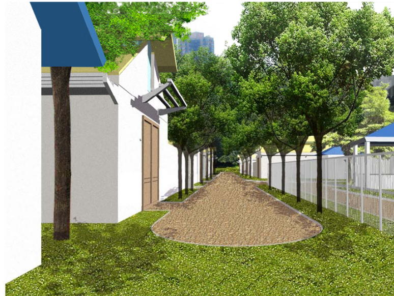
10 YEARS AFTER OLYMPIC EVENT